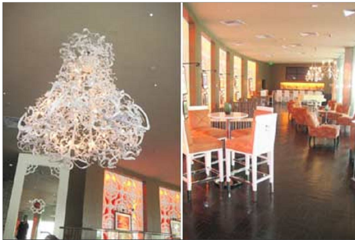
Inside of the Riviera Resort and Spa

I am sad that this will be my final day luxuriating in the Springs, but I am elated that I have gotten to experience most of what this destination has to offer. There is so much more that I didn't have time to explore, but that just makes for a great excuse to come back!