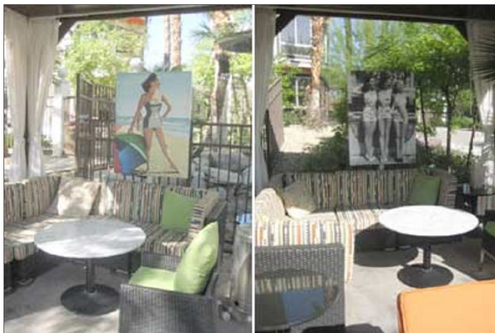
Private Cabana's near the pool at the Riviera

For breakfast, I opted for the Almond French Toast with cinnamon butter and warm buttery syrup, Scrambled Eggs, Seasoned Breakfast Potatoes, and savory Turkey Sausage. My favorite was the French Toast that had a bit of a crispy texture.