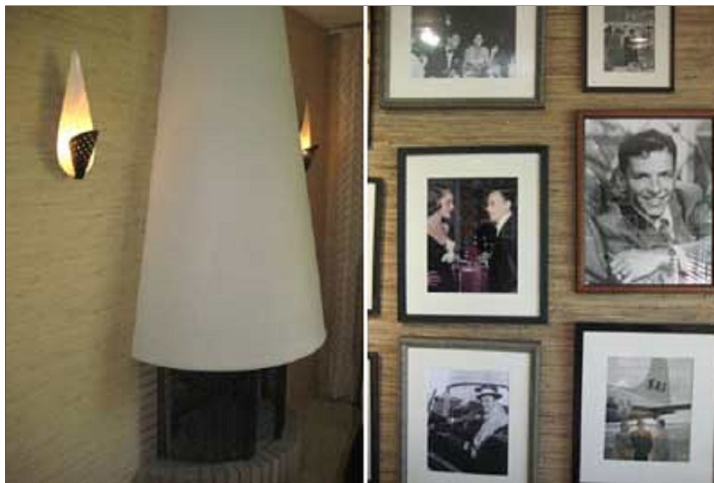
Inside the bedroom at Mr. Sinatra's estate

The Palm Springs Preservation Foundation hosts a variety of viewing events at homes such as Twin Palms. It is the foundation's mission "to educate and promote public awareness of the importance of preserving the historical resources and architecture of the City of Palm Springs and the Coachella Valley area." The estate is available for rentals through Beau Monde Villas and I am thinking of how I can rent it out now!