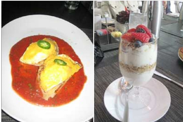
Huevos Rancheros (r), and Yogurt Parfait (l)

The Riviera is a place that I would definitely like to invest more time in getting acquainted with on my next visit. With that said, it was time to go and visit the home of Mr. Blue Eyes himself, Frank Sinatra.