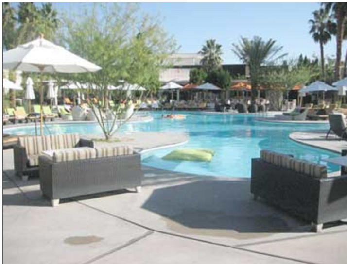
Pool area of the Riviera