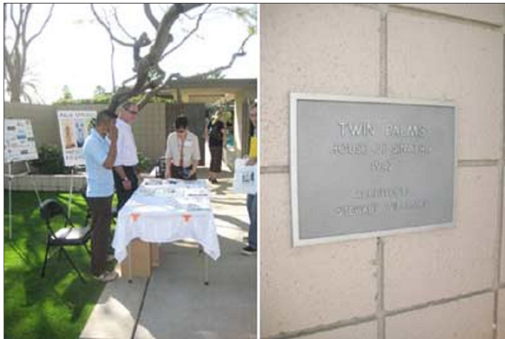
Frank Sinatra's home, Twin Palms

The Twin Palms Estates , as it is known, was designed by E. Stewart Williams in 1947 for Frank Sinatra and his first wife, Nancy Barbato . Seemingly modest in location, this 4,500 square foot home embodies all the glamour of an era when the Rat Pack seemed to rule the town. Featuring a piano-shaped pool and a circular driveway, I could only imagine the cars that pulled into this estate and the old Hollywood celebrities that flanked around the pool on a warm, summer's night. A fun tidbit shared by our home tour guide surrounds a chip in one of the bathroom sinks. The story behind the chip is that Frank threw a bottle when his then wife Ava Gardner appeared at the house in an attempt to catch him cheating with ex-girlfriend Lana Turner . Some things will never change, right ladies? Although the original furnishings of the home have been replaced, a large record player in the living area is an original.