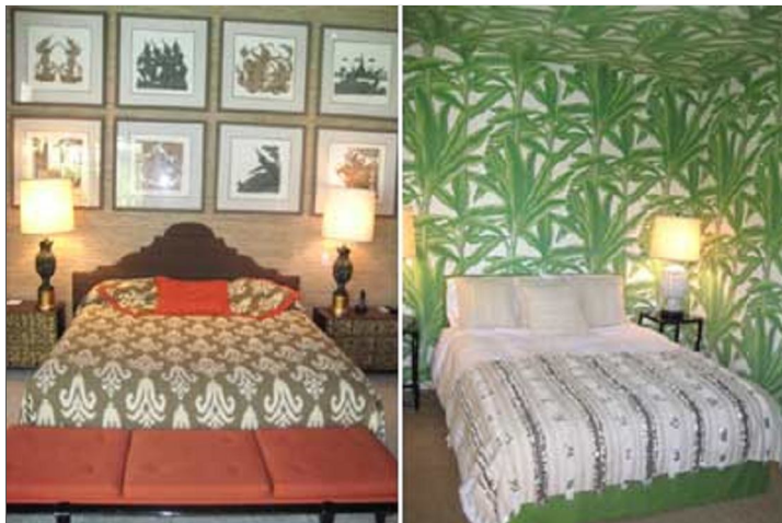
Master bedroom (r) and Maid's Quarter bedroom (l)

The Palm Springs Preservation Foundation hosts a variety of viewing events at homes such as Twin Palms. It is the foundation's mission "to educate and promote public awareness of the importance of preserving the historical resources and architecture of the City of Palm Springs and the Coachella Valley area." The estate is available for rentals through Beau Monde Villas and I am thinking of how I can rent it out now!