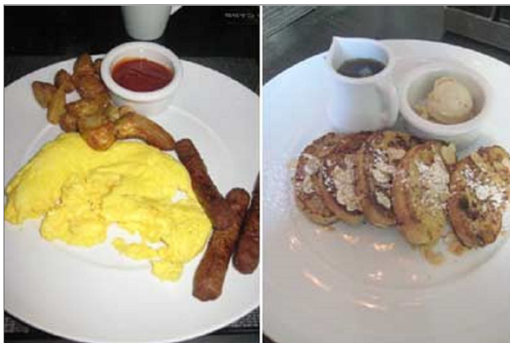
Egg breakfast with Potatoes and Turkey Sausage (l), and Almond French Toast (r)

For breakfast, I opted for the Almond French Toast with cinnamon butter and warm buttery syrup, Scrambled Eggs, Seasoned Breakfast Potatoes, and savory Turkey Sausage. My favorite was the French Toast that had a bit of a crispy texture.